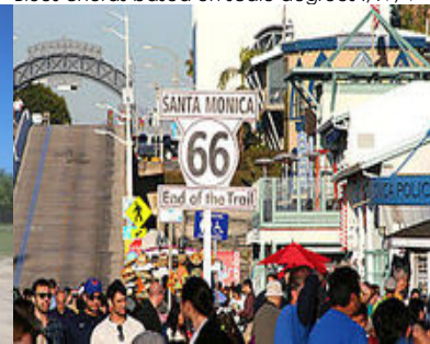
End of Route 66, Santa Monica, CA.