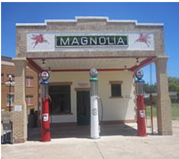
Gasoline Station Museum, Texas.