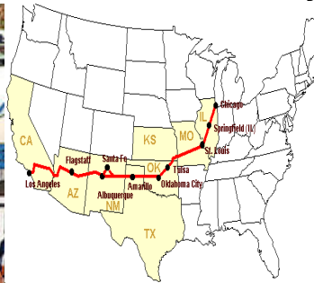
Route 66 Map